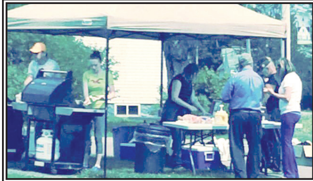
Several Community Groups will set up food concessions during the 75 KM yard sale on July 9 & 10th.