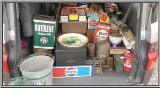
You never know what you will find at the 75 KM yard sale. This vendor from last year was offering a wide assortment of goodies.