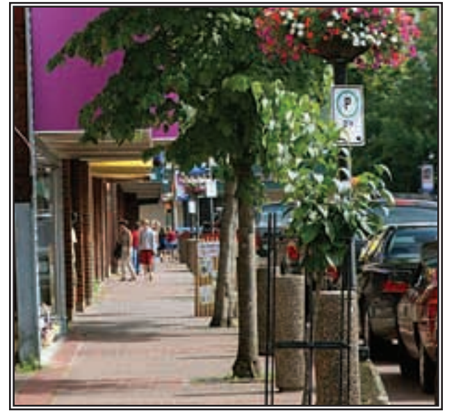
Inglis Street is the hub of retail shopping experience in downtown Truro.

The Eagle Crest Walk in Bible Hill begins at Warren Drive off College Road. This 1.1 km section with crushed gravel surface passes through maple stands and hemlock ravines and offers scenic views overlooking the Salmon River. The Trail continues via sidewalks and