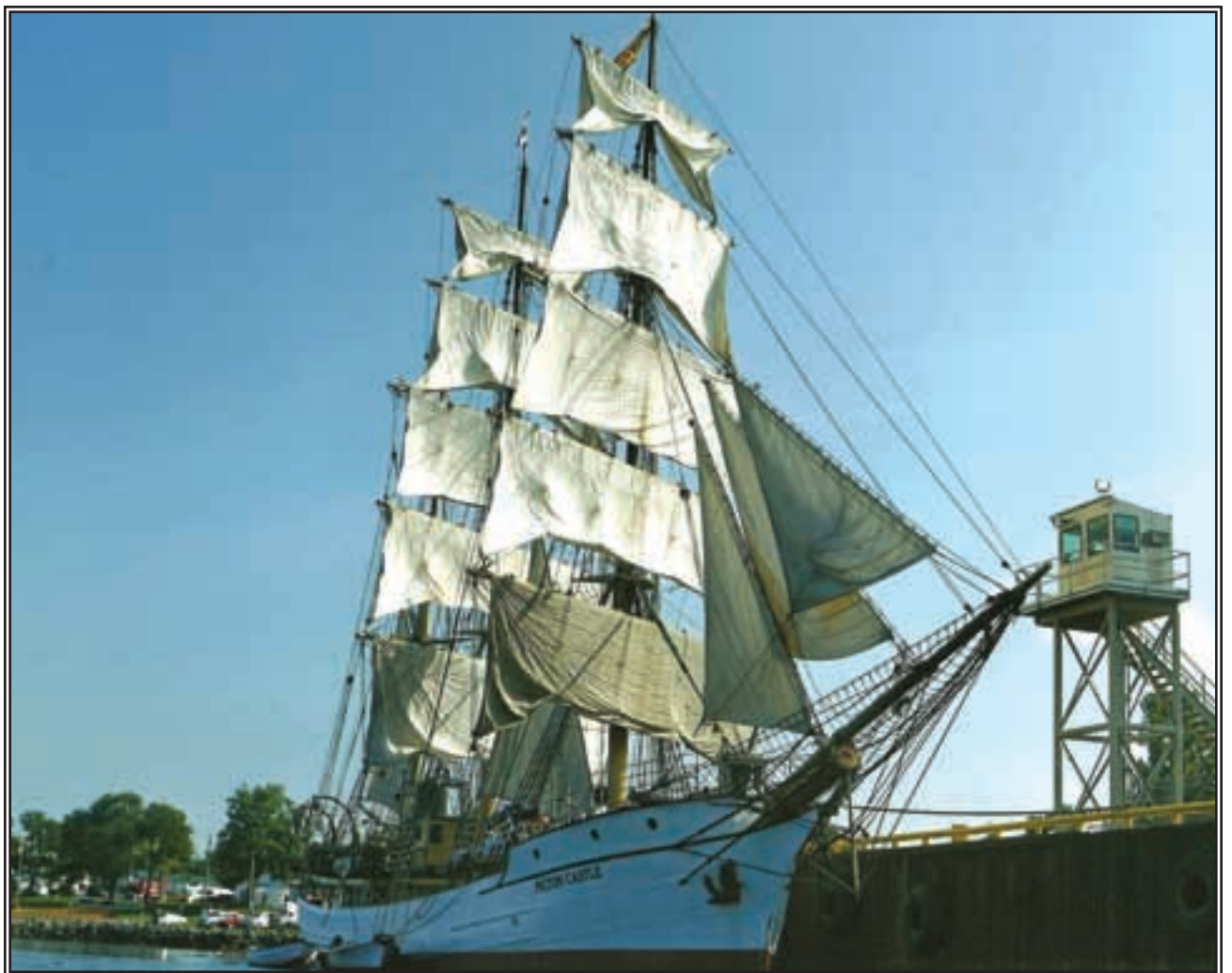
July 27 to 29, the Picton Castle will be one of the featured Tall Ships at the 'Pugwash HarbourFest 2012', Cumberland County's Premiere Ocean-Front Event. Visitors can enjoy for helicopter rides, Theodore Tugboat, high-speed boat races, a beach volleyball demonstration & tournament, entertainment and more! See page 12 for the event schedule.