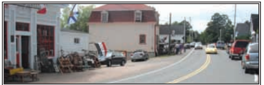
Yard sale enthusiasts shown in Great Village in 2011. This year the yard sale will be held on July 14 & 15 from Mingo's Corner in Onslow along Highway #2 to Parrsboro and on July 14th along Highway 209 from Wharton to Brookville in the Port Greville area.