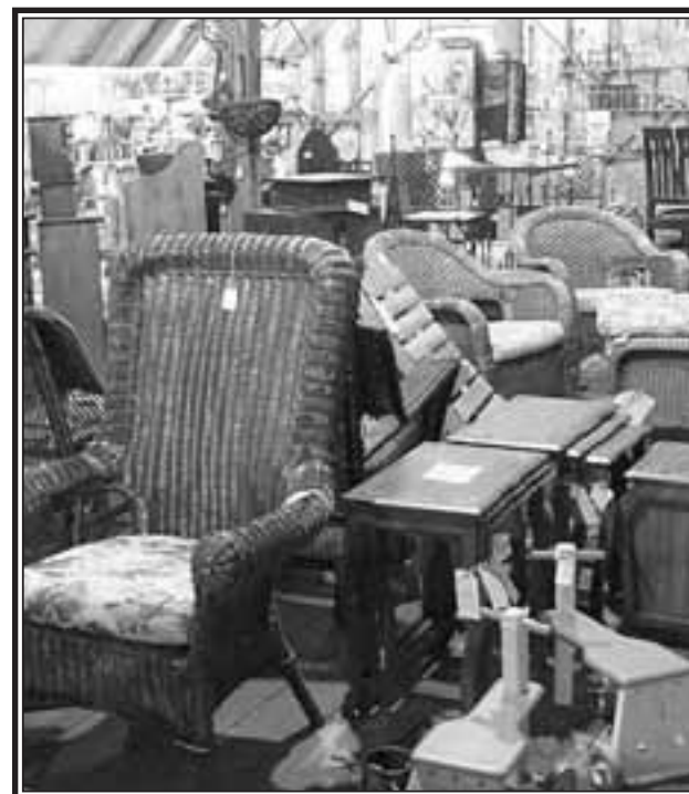
Dominion Chair, a country store in Bass River for over 150 years, has a huge assortment of treasures hiding in the upper floors. From gift ware to unique pieces of furniture, there is something for every taste.

I would like to personally thank everyone who sent "Get Well" cards, best wishes and prayers during my recent bout of surgeries. Each was very greatly appreciated.