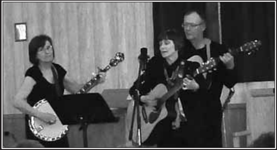
Kitchen Trio took to the stage before a large crowd at the Masstown United Church Variety Concert on May 15th. A lengthy list of performers gave of their time to help raise money to repair the Church roof.