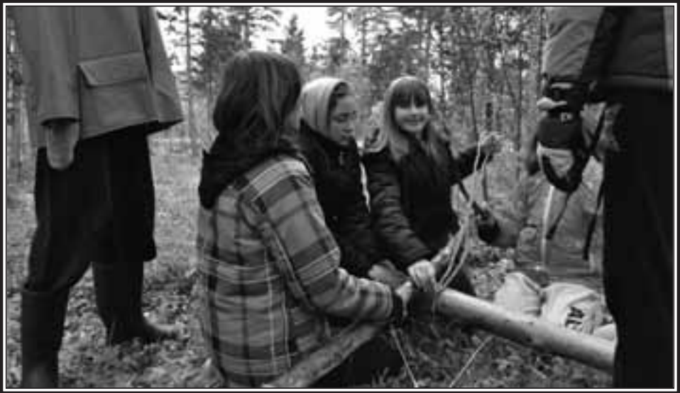
A group of 18 Girl Guides from the Debert and Truro units traveled to Cape Breton on the May long weekend for a 3 night camp hosted by the Scouts. The weather was unseasonably dreary, but the girls would not be discouraged by the cold and rain. They worked on projects that included knots and lashings, as well as orienteering through a heavily wooded area. The girls especially loved the traditional campfire, where they sang old favourites and learned new songs and yells. (Submitted)