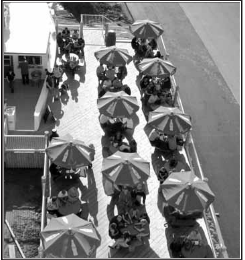
From high atop the lighthouse, Masstown Market's "Catch of the Bay" deck is becoming busier everyday.