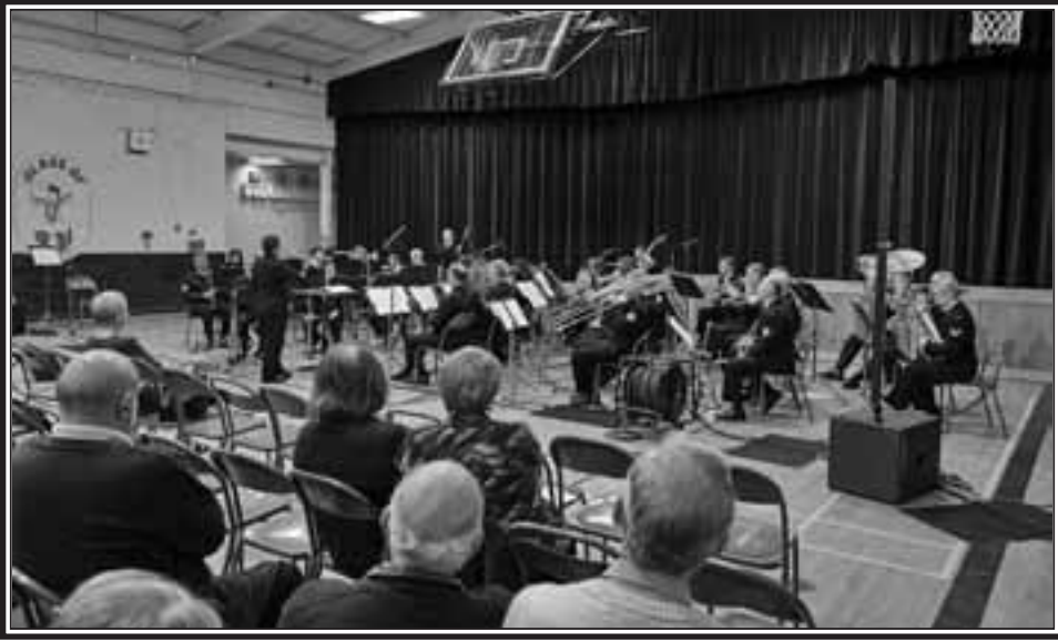
Parrsboro was honoured to again have the opportunity to be entertained by the Stadacona Band (of Maritime Forces Atlantic) on Mother's Day, May 8th at Parrsboro High School. The band presented a variety of different styles of music both new and old leaving all who attended enthralled by the quality of the voices and orchestral sound that filled the auditorium. This is the second year in a row for the band to come to Parrsboro.