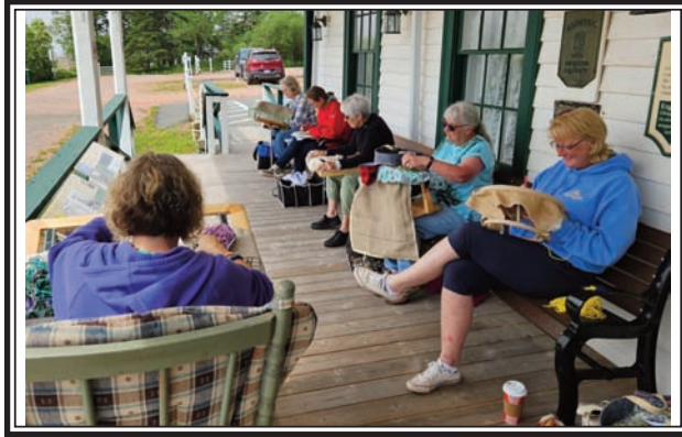
Once again the Hookers on June 13, 2024 (Rug Hookers that is) were back for their Thursday get together at the Ottawa House sharing the company of each other and marvellous skills. Some beautiful work results in this gathering. Many are glad to see them return for another year.