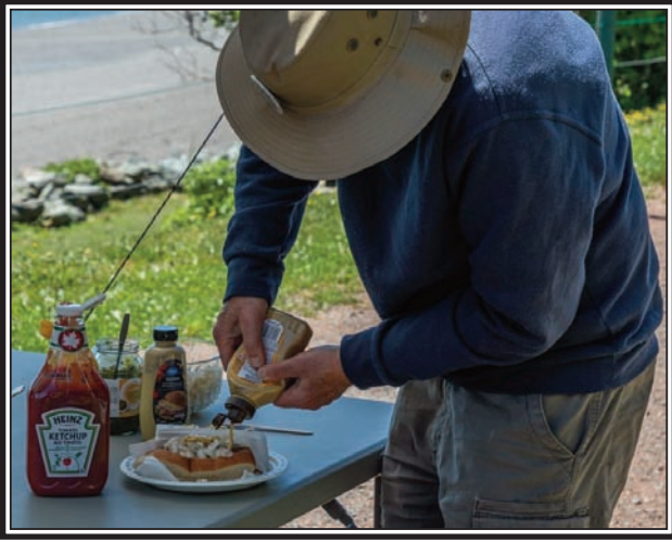
Sunday June 16th was BBQ and Father's Day at the Ottawa House by-the-Sea Museum. Menu included Hot dogs, sausage and hamburgers !! They were fantastic and enjoyed by the many who purchased. A great fundraising effort at its' tastiest.