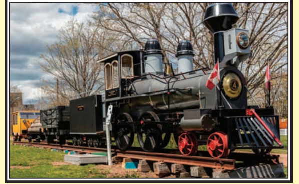
Kerwin has built three trains with one still remaining in Parrsboro and is moved each year for display next to the former town hall.

Proudly presented by the South Cumberland NEWS