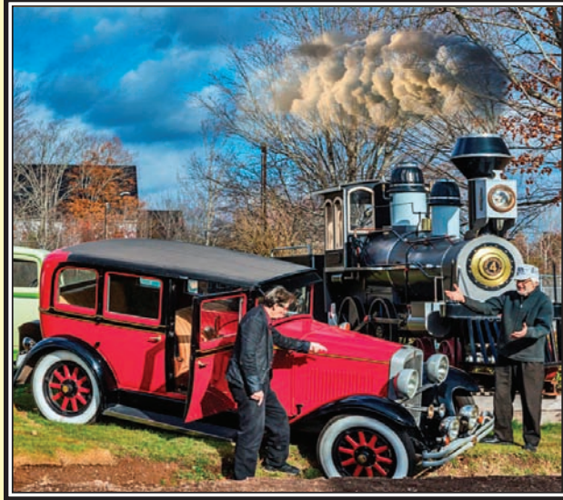
An interesting display of full size models in Parrsboro was Kerwin's replica of #4 train, and a wreck with the 1929 Nash "Rum Runner" he built and drove.