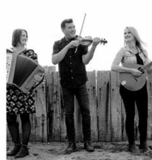
Vishtèn July 24