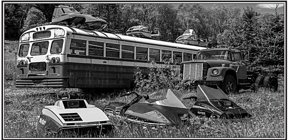
This super bus on Hwy 209 and six snow sleds has become a popular stop for tourists.