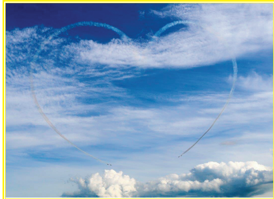
One of the unique formations, a perfectly formed heart, was performed by the Canadian Armed Forces 'Snowbirds' at the Debert Flight Centre on June 19th. Air Show Atlantic which has produced shows in Shearwater, Yarmouth, Greenwood and at the Stanfield International Airport can now at the Debert Flight Centre to that list. See our photo spread and story on pages 16 and 17.

pectations of what can be delivered, for residents and business owners, who have been clamouring for improved internet service. Once the plan has been finalized, things like geographic scope, service levels, timeline and roll-out strategy, financial scenario, and value-for-money will be revealed at the appropriate times. Financial estimates relating costs of the two-county project has not been revealed, nor has the required contributions from Provincial, Federal and Municipal sources. Although details are sketchy, residents and business owners in Cumberland and Colchester Counties can start breathing a sigh of relieve improved broadband services are getting much closer that at any other point in history. When construction might start, and how long the "roll-out" will take will not be revealed until DNS has made its decision on acceptance of the two county initiatives.