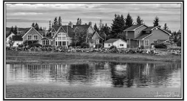
The quaint beauty of Parrsboro Harbour rivals any place in Nova Scotia. Now that the community has a new sewage treatment plant and sewer line collection system walking along the shoreline will be more enjoyable.