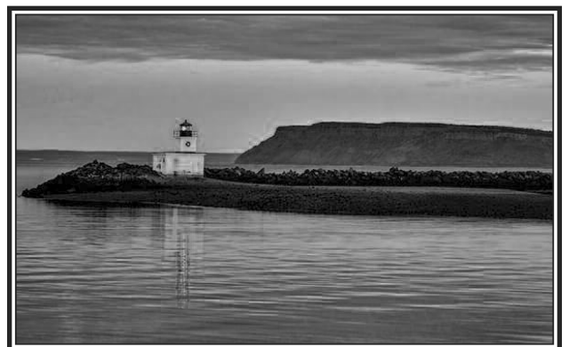
Not as popular or photographed as much as Peggy's Cove Lighthouse, but the Parrsboro Lighthouse is often the choice of photographers who want to capture a terrific sunset reflecting off a traditional lighthouse.