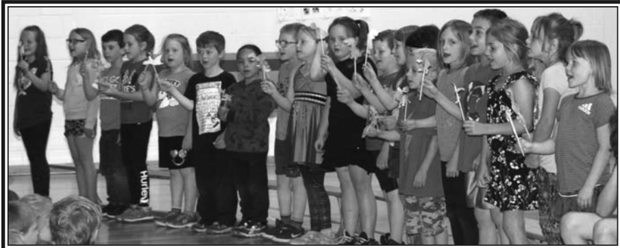
Great Village Elementary Grade One/Two Class performing at the Volunteer Tea on June 13th.