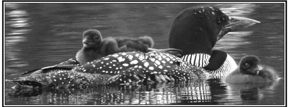
Getting a ride from mamma, as she keeps her young chicks close by!