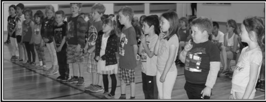
Great Village Elementary Grade Primary Class performing at the Volunteer Tea on June 13th.