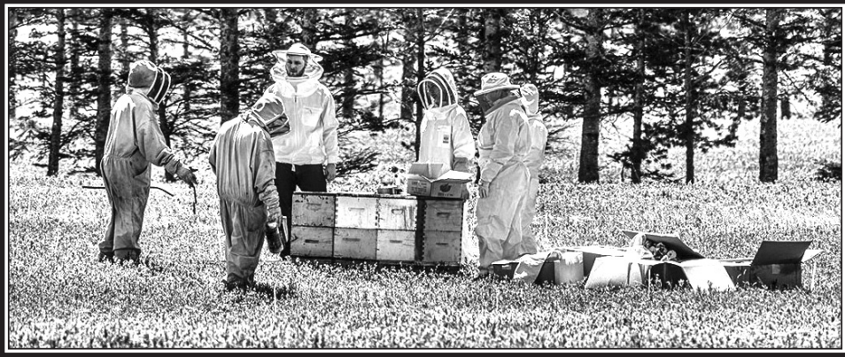
Even though prices are at a near historic low, blueberry farmers rely on thousands of bee hives to pollinate the berries.