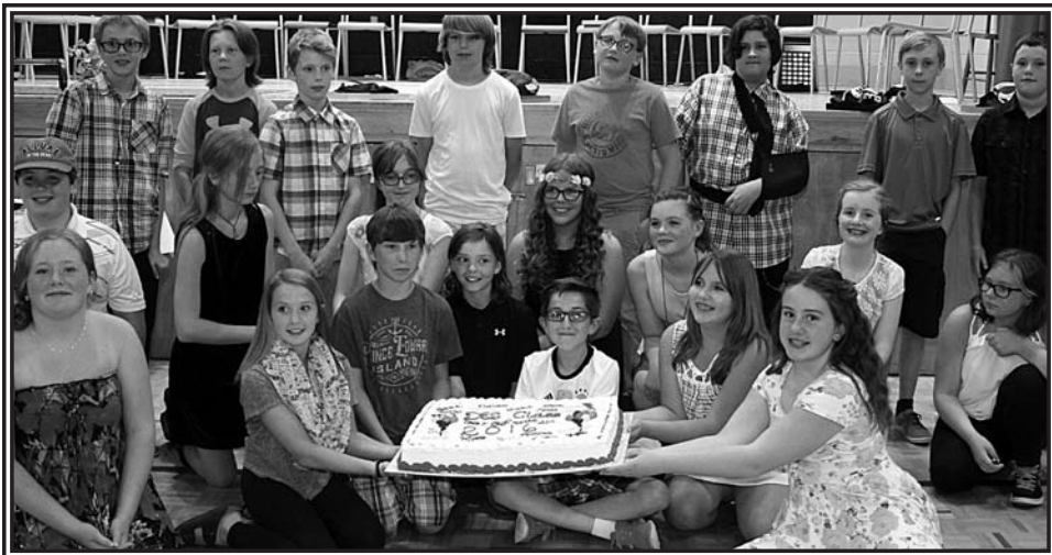
One final DES Grade 6 class photo with their graduation cake.