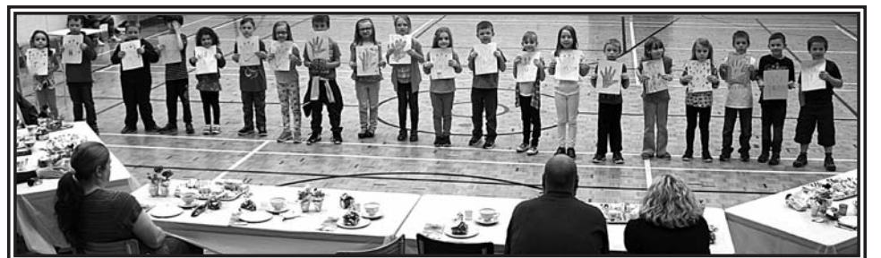
The Grade One students spelled out a huge "THANK YOU VOLUNTEERS" and each read a phrase of gratitude.