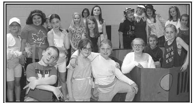
The Debert Elementary Grade 4-6 Drama Students prior to their performance of The Littlest Scientist.