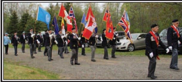
The Legion Colour Party enters Veterans Memorial Park.

International Day of United Nations Peacekeepers- May 30th service at Veterans Memorial Park in Bass River