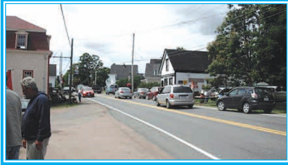
Motorists are asked to observe extreme caution on July 11th & 12th as hundreds of additional vehicles will be flocking to the area from Onslow to Parrsboro for the annual 75km yard sales. Shown above is traffic congestion in Great Village during last year's sale. Groups and individuals are urged to participate and make the event an enjoyable experience for the dedicated "yard-salers". (Submitted)