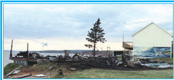
The cottage owned by Bill Taylor was burned to the ground after sparks from a brush fire caught underneath. Fire fighters prevented the cottage next door from catching fire, too.