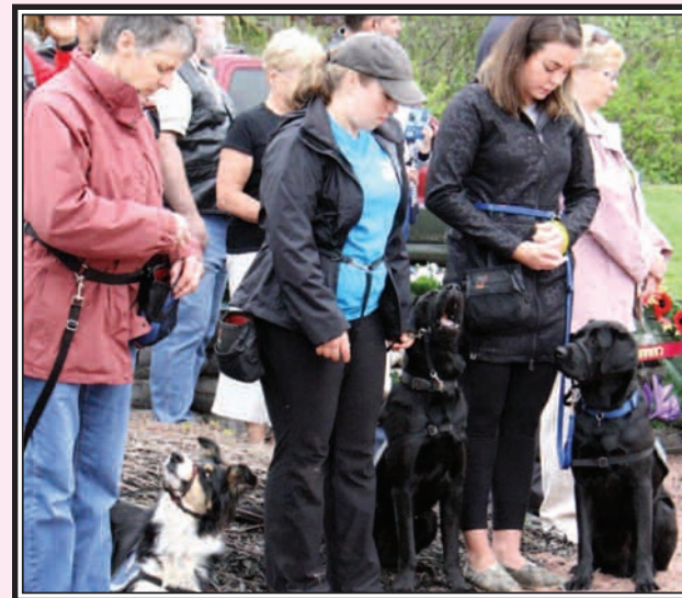
Maritime Specialty Service Dog Society provides service dogs for Veterans.