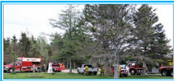
Fire fighters from Economy, Bass River and Great Village answered the call to Five Houses where high winds threatened several cottages, with one cottage burning to the ground and another suffering extensive damage.