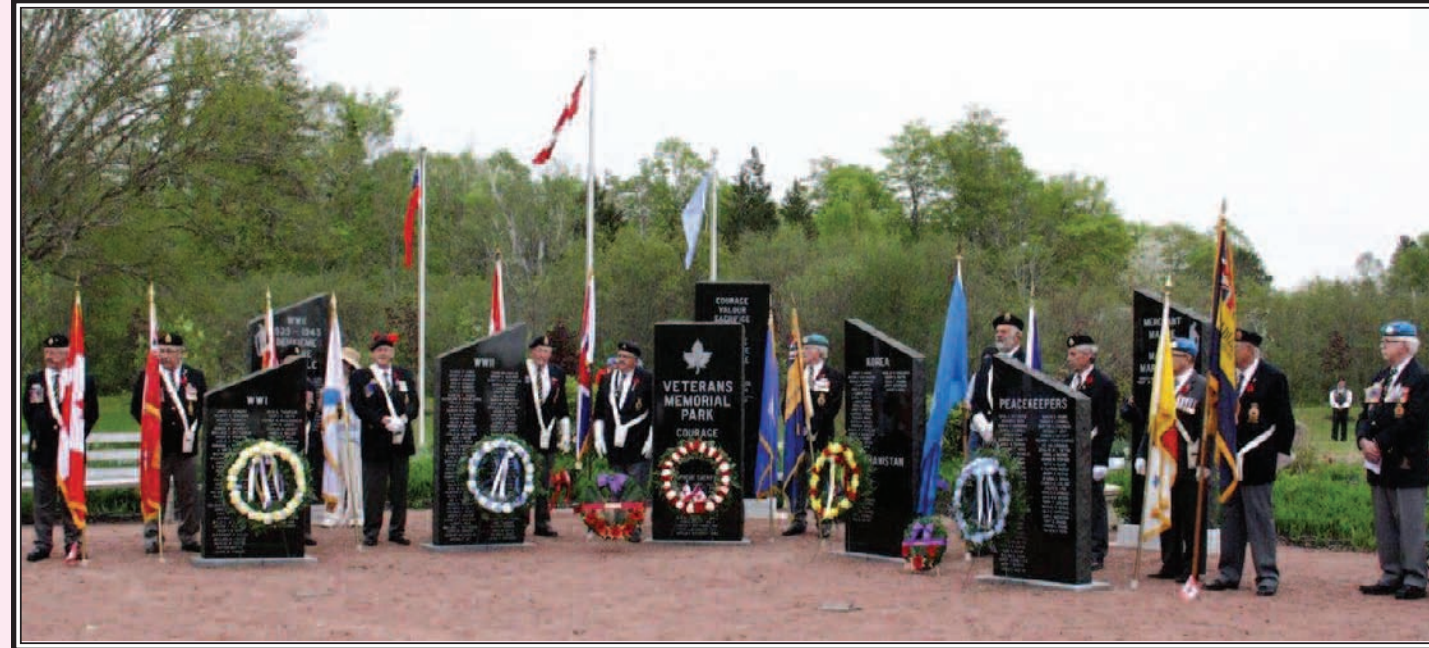
Legion Colour Party following the laying of wreaths.