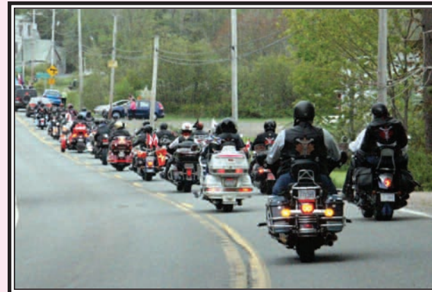
The long line of motorcycles headed to the Park.

is proud to provide coverage of community events.