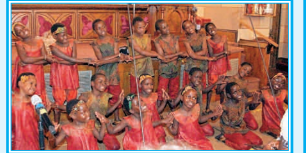
AMAZING! The performance by the African Children's Choir, for a capacity crowd at the Village Café in Great Village, was captivating. With smiles that lit up the room, dancing and singing their young hearts out, one could not help but leave the concert feeling energized and amazed. The choir performed later in Parrsboro and then move on to New Brunswick.