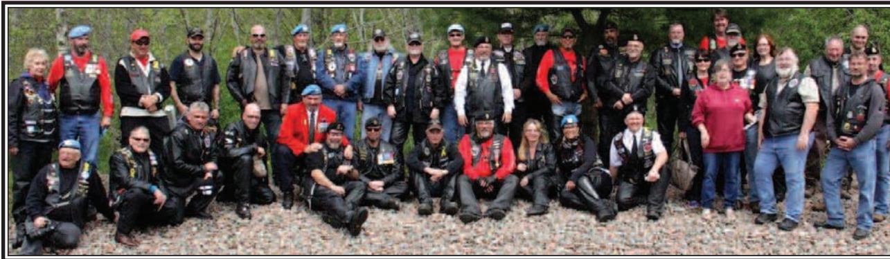
UN/NATO Veterans Group and Defenders pose for a group shot.