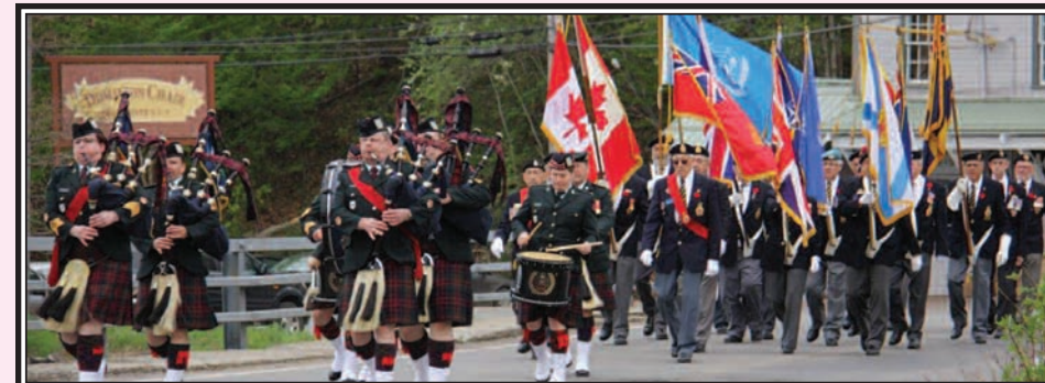
1st Nova Scotia Highlanders Pipes & Drums lead the marching parade.