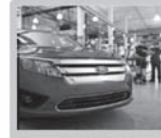
LIFETIME NS SAFETY INSPECTION For as long as you own your vehicle.