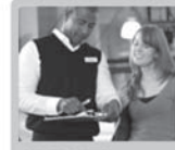
WARRANTY 3 month / 5000 km Ford backed warranty.