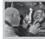
115 POINT INSPECTION Detailed inspection performed by factory trained technicians.