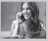
ROADSIDE ASSISTANCE 24 hour roadside assistance. You are covered day or night.