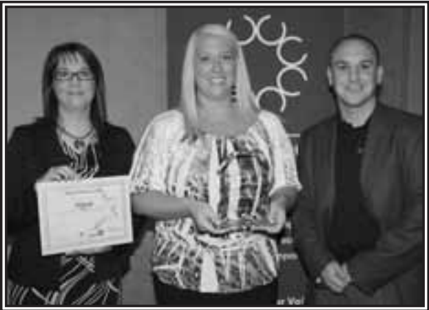
Dining/Restaurant/Pub Winner: Frank & Gino's Runners-up: Bistro 22, Murphy's Fish & Chips Award Sponsor: Berry's Furniture Plus