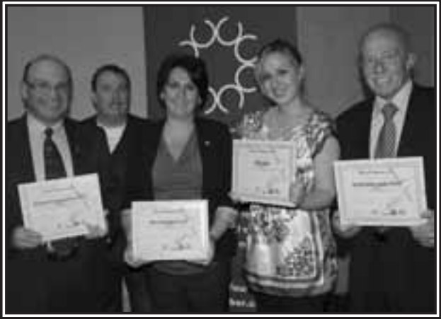
Financial Services Winner: RBC Truro Runners-up - Scotiabank, TD Bank, CIBC Truro (Tie for 3rd) Award Sponsor: Murphy's Fish & Chips