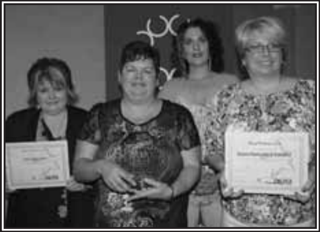
Hair Salon/Barber Winner: Head Experts Salon and Barber Shop Runners-up: Inglis Place Salon, Square Roots Hair & Esthetics Award Sponsor: KFC/Greco Pizza