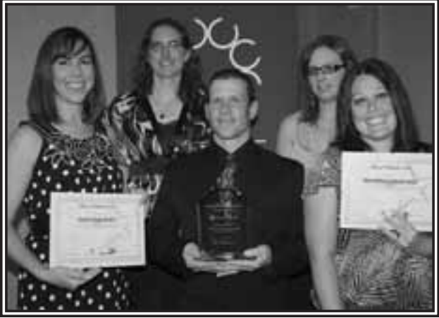
Health Centre Winner: MacKinnon Fitness/Breathing Space Yoga Studio Runners-up: Well Within Chiropractic, Joyful Yoga Award Sponsor: Grant Thornton