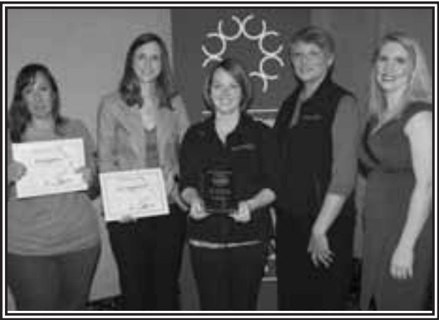
Home Décor/Furniture Winner: Berry's Furniture Plus Runners-up: Leon's Furniture Store, Wicker Emporium Award Sponsor: A.P. Reid Insurance Stores