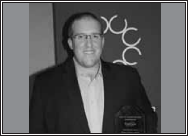
Grocery Store Winner: Sobeys - Prince Street Runners-up: Sobeys - Robie Street, Atlantic Superstore Award Sponsor: Patterson Law