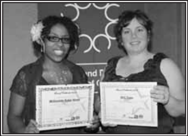
Fast Food Winner: Wendy's Runners-up: KFC Truro, McDonald's Award Sponsor: Best Western Glengarry Plus