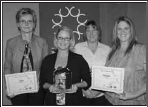
Department Store Winner: Walmart Runners-up: Giant Tiger, Zellers Award Sponsor: Alpha Social Media Inc.