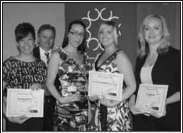
Day Spa/Tanning Salon Winner: Bella Santé Holistic Health Centre and Spa Runners-up: Absolute Tanning, Truro Medi Spa Award Sponsor: CIBC Wood Gundy