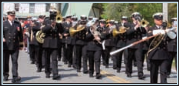
The Stadacona Band of Halifax provided music on parade and during the International Day of UN Peacekeepers Service. The band is one of only six regular force military bands in Canada.