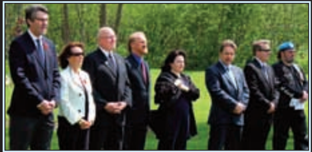
Special guest speakers listen to selections by the Stadacona Band during the International Day of UN Peacekeepers Service.