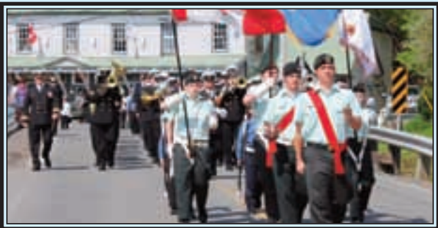
Members of the 2928 Army Cadets Color Party lead the parade from WCCS to the Veterans Memorial Park in Bass River.