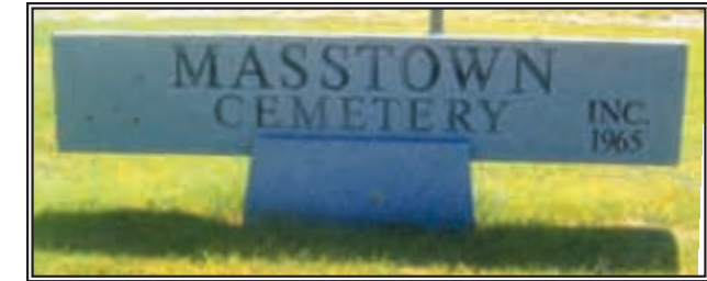
The Masstown Cemetery contains graves of 18 identified veterans. If a veteran's name has been omitted from the various lists published elsewhere on these pages, please contact a legion member.