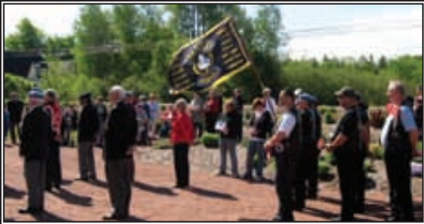
The flag of the UN/NATO Veterans Association flies in the breeze during the International Day of United Nations Peacekeepers Service held in Bass River at The Veterans Memorial Garden.