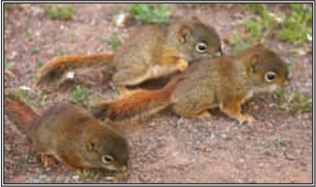
These cute little orphans came tumbling out of the woods in a flurry of activity. The triplets turned out to be quadruplets, when another sibling turned up a day later.

The next Council meeting will be on September 15, 11 a.m. to 3 p.m., at Shinimicas with the Northport Sunrise Senior Citizens as host.