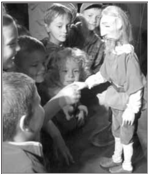
The world-renowned Maritime Marionettes, based in Truro, Nova Scotia, brought their delightful production of the classic folk tale, The Bremen Town Musicians , to Ship's Company Theatre in Parrsboro. Shown are area children following the performance, captivated by one of the play's lifelike characters.