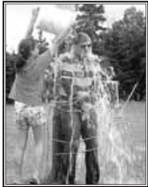
Sometimes water at summer camp is cold, but its even colder when confined to a stockade and you receive a bucket of cold water. All the part of summer camp. (Submitted)

Campfires and soggy marshmallows, water games and beach scavenger hunts, good food and great friends have been a part of Camp Pagweak since 1944! It's nothing new to hear children's laughter and shouts coming from across the harbour and into the village of Pugwash on a hot, summer's afternoon. It seems that wherever you go, someone has a story to tell about Camp Pagweak.