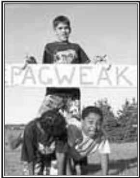
Children attending Camp Pagweak enjoy forming a human welcome sign as part of camp activities. The memories last forever.