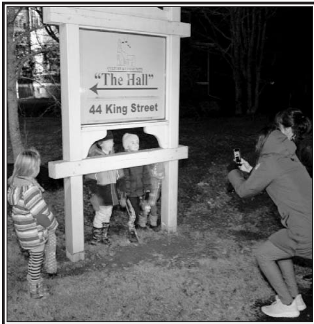
Traditionally, after the parade Santa went to The Hall to visit with the children. This year with CoVid surging, the event at the Hall was cancelled, but these children wanted to keep the hall at top of Mind. See story and additional photos on page 3.

Government is making the most significant infrastructure investment in Nova Scotia history to modernize health-care facilities in Cape Breton Regional Municipality, Halifax Regional Municipality, Bridgewater, Pugwash and across the province.