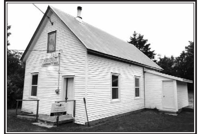
Portapique's Riverside Community Hall

The Rotary Club of Truro has partnered with the Community Foundation of Nova Scotia to receive donations from individuals through the "We Rise Again Fund" with a stated project goal of $500,000.