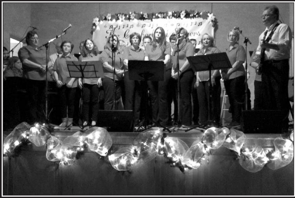
The Cumberland Singers perform in Wentworth a concert called "The Sounds of Christmas" with vigour and beauty.