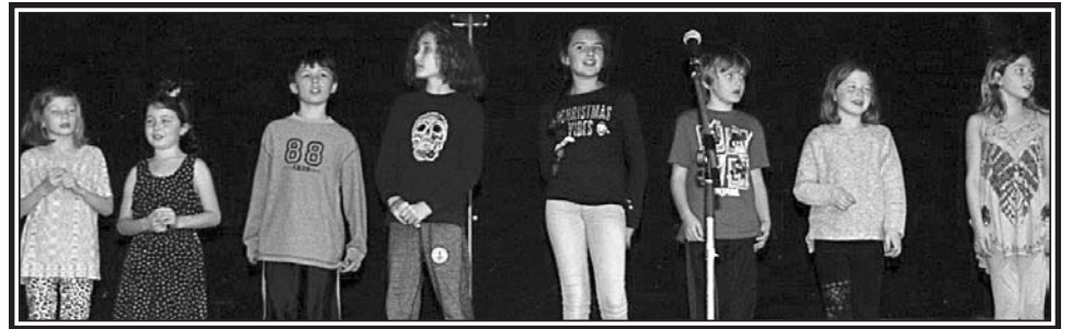
WCCS Grade 3,4,5 Class singing "I Want a Hippopotamus for Christmas".