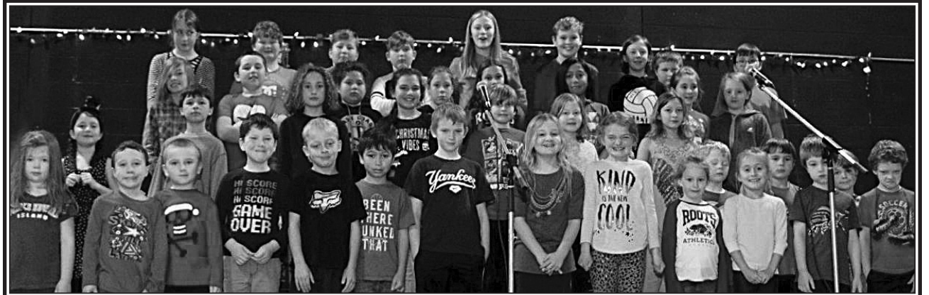
The Primary to Grade 6 Classes at West Colchester Consolidated took to the stage together to sing Welcome Christmas and Feliz Navidad during the Christmas Concert on Dec. 13th.