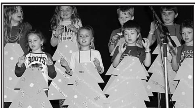
Primary, One and Two Classes singing the Happiest Christmas Tree.