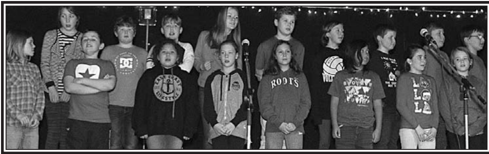
Grade 5 & 6 students sing Grandma Got Run Over by A Reindeer during the WCCS Christmas Concert.

Photos are from the afternoon dress rehearsal.