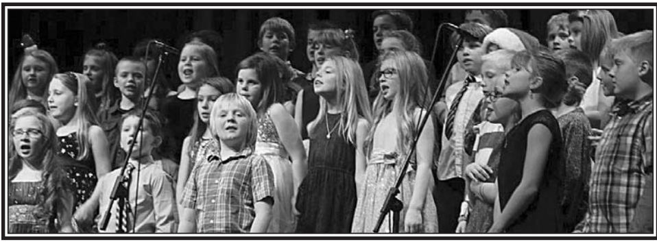
Several students from the combined Grades 2's & 3's classes.