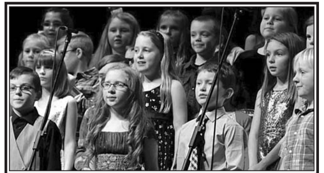
Combined Grades 2 & 3 classes.