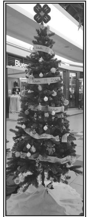
The Clifton 4-H Club Christmas Tree is part of the 4-H tree display at the Truro Mall. Donations can be made while voting, plus the winning tree receives $250.00.