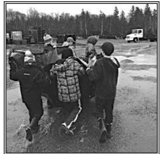
The members haul the leftover branches from their wreaths.