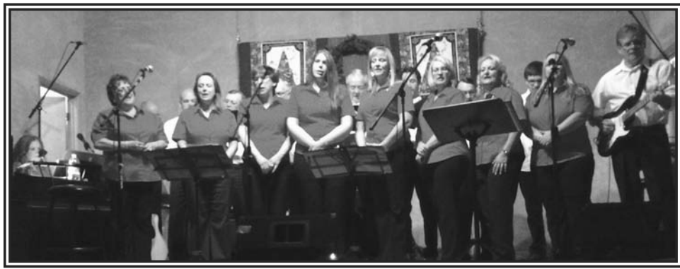
The Cumberland Singers gather on stage at the Wentworth Recreation Centre performing at the Songs of Christmas Concert in a spirited and compassionate style.