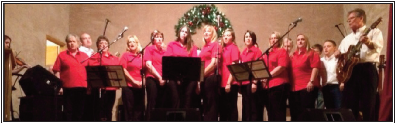
The Cumberland Singers perform a successful concert "Sounds of Christmas" at the Wentworth Recreation Centre with the focus on raising funds for the charity Chalice-Child Care International.

During the recess, people had the chance to visit the canteen, renew acquaintances and hear the winners of a raffle draw.