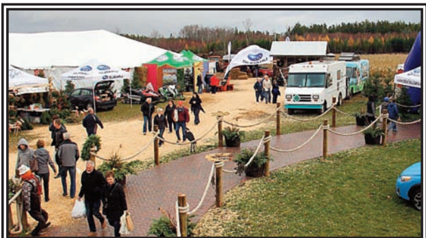
There was plenty to eat, see and enjoy at the fall Saltscapes Expo, held for the first time in Masstown.