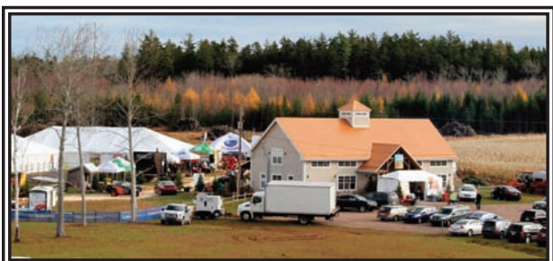
Captain Cob's Corn Maze and The Peg were transformed into a delightful Saltscapes Expo on Nov. 14th & 15th, showcasing local products, foods and entertainment.