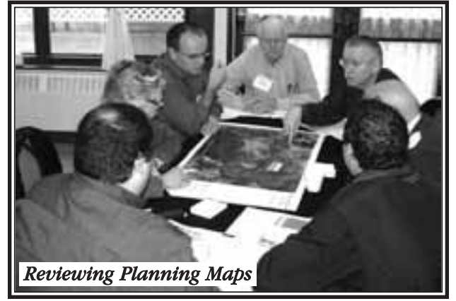
Reviewing Planning Maps

Participants were then asked for their thoughts and contributions to what the "Debert Vision" will look like. Community residents and business operators had several suggestions for facilitators including being conscious of noise and truck traffic in the residential areas, increasing amenities to attract more residents, keeping the effects on existing businesses in mind as new businesses move in, looking at an interchange for residents to have easier access to their homes away from truck traffic, and replacement of the water tower.