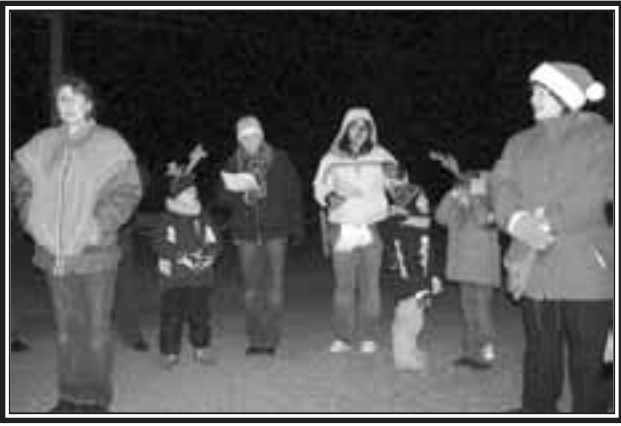
The weather was seasonably cool for the first annual Community Tree Lighting on Dec. 8th at Debert Baptist Church. Hot cider and cocoa were a welcomed treat afterwards.