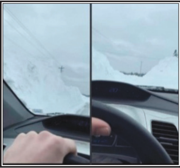
From the one lane opened roadway, snowbanks on Five Houses reach skyward like mountains. Road crews had to bring in additional machinery to open up Highway 2 and arteries. In some instances it took in excess of 40 hours to clear drifts from storm, which many say was the worst in memory.