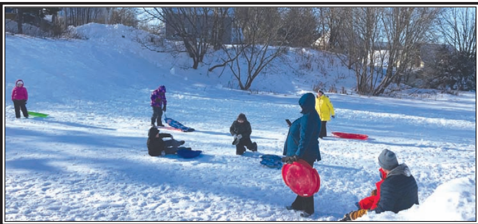
The winter storm on January 15 brings lots of snow to the delight of children and families enjoying sledding on Sunday, at the Royal Canadian Legion Hill on Brunswick Street in Truro.