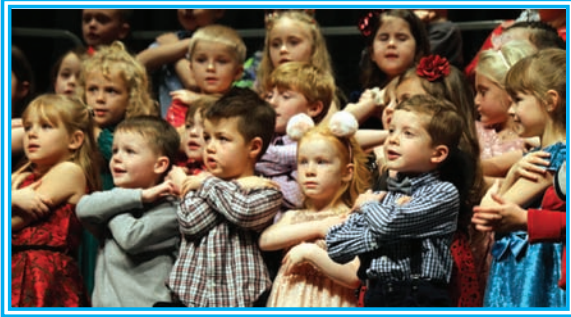
Adorable performers from the Grade Primary class.