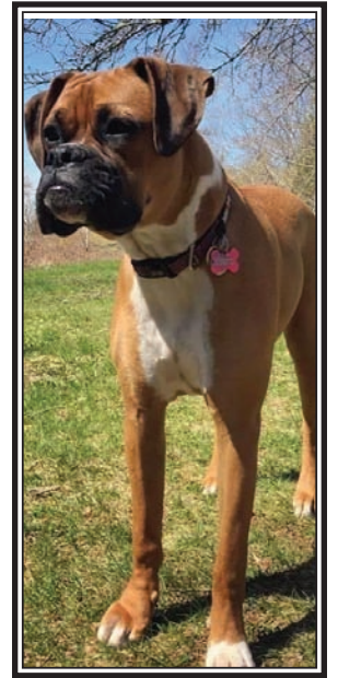
Annie has been missing since Dec 23 from her home in Masstown and an anonymous pet lover has generously offered a $1000 reward for information leading to Annie's recovery.

was wearing a pink collar with tags when she went missing. She is a very friendly dog but once an animal is on the lose for so long, they can become very skittish and leery of people. If anyone sees her, do not approach her but try to get a photo and contact her family at 902-890-5925. The family is also looking for closure if someone knows anything about what has happened to Annie.