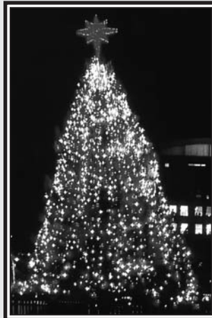
Nova Scotia's annual tree donated to Boston is shown in all its splendor once the switch was flipped during the tree lighting ceremony.

"We may not remember, but we have a responsibility to tell the story so that this great deed is not forgotten."