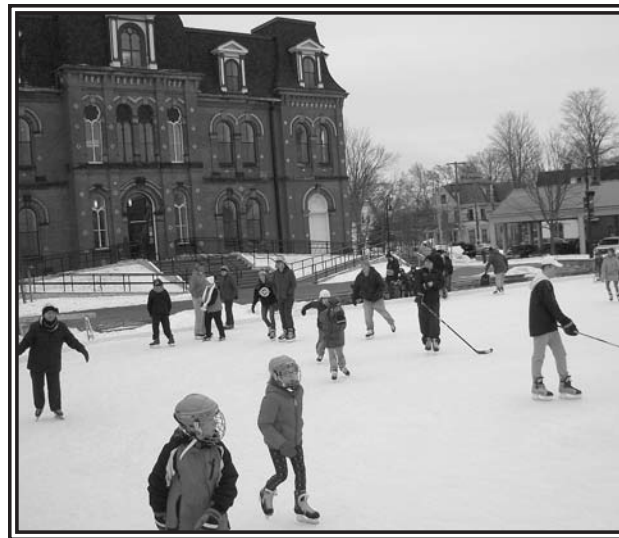
Join your friends for the kick off of the Long John Festival at Civic Square in Downtown Truro. There's live entertainment, refreshments and more. See the Long John Festival schedule on page 10 and 11 for details.