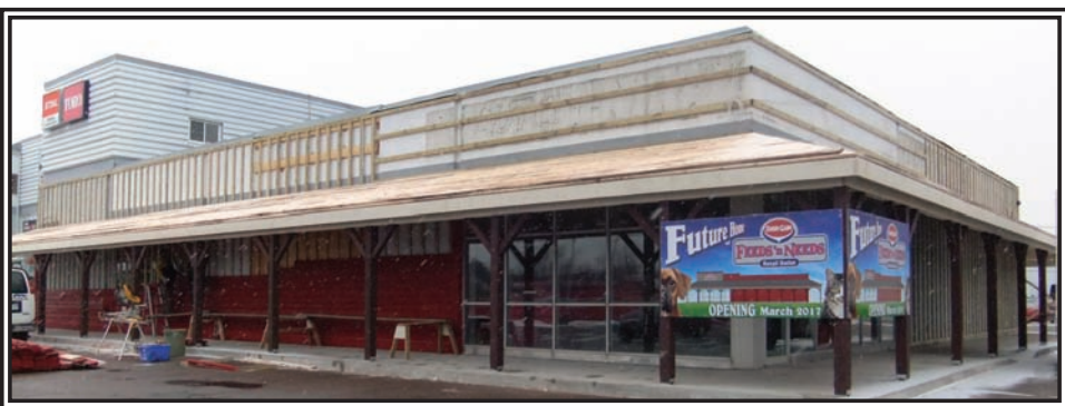
Shur-Gain Needs and Feeds will be relocating to the former Cox Hometown Flooring location in Juniper Street in March. Interior renovations, plus a new deck are ongoing. A new warehouse will also be built.