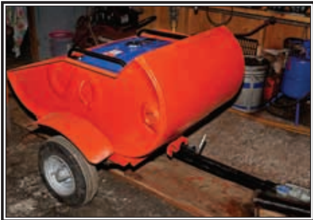
Converting a 100 gallon discarded oil tank into a utility trailer was a useful project for Allison MacAleese.