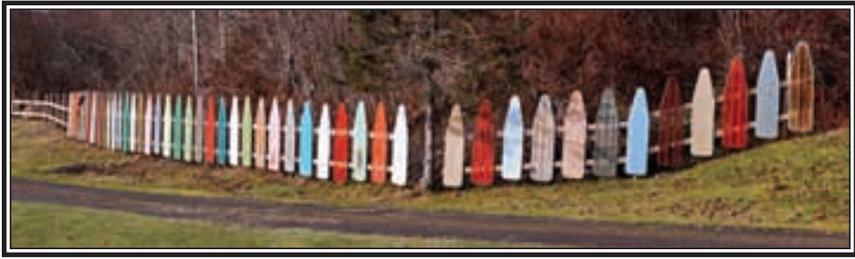
A property fence composed of discarded ironing boards built by Allison "Bubba" MacAleese, New Prospect is often photographed by motorists.