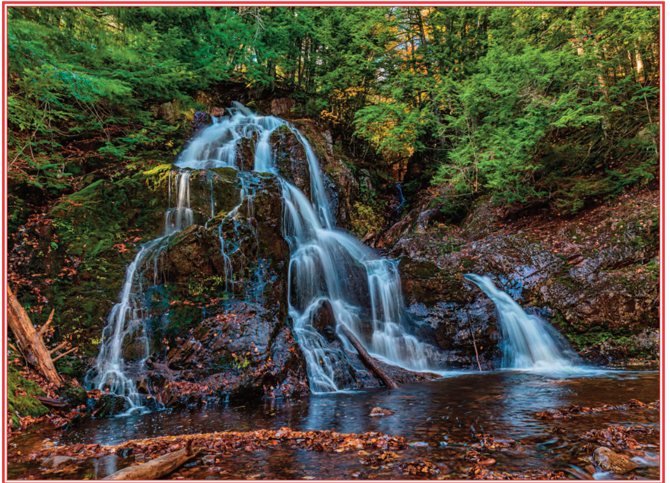
Wentworth Bridal Falls. It has been a tough year for waterfall viewing, many are barely a trickle. Just after a rainfall I decided to visit Bridal Falls in Wentworth, and it still presented a beautiful image for me Nova Scotia is always worth the visit!

Quick Facts: the Creative Nova Scotia Awards are presented by Arts Nova Scotia and the Creative Nova Scotia Leadership Council; the event was held at the Lord Nelson Hotel in Halifax and was produced by live art company HEIST and hosted by theatre artists Zuppa; the Portia White Prize provides $18,000 to the recipient and $7,000 to the protégé, or secondary recipient, who is an emerging artist or a cultural organization and collectively, this year's recipients received $75,000 in prizes.