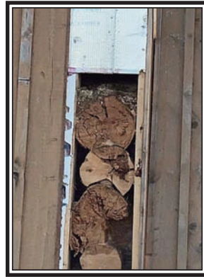
portant community activities

For over 40 years, the Fundy Tides Recreation Centre - built by Carson Spicer in 1982 - has been the hub of a variety of im-