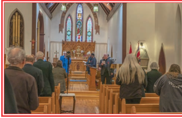
The weather certainly did not cooperate so after a brief service at the Anglican Church, the ceremony was moved indoors to The Canadian Legion Branch 45.