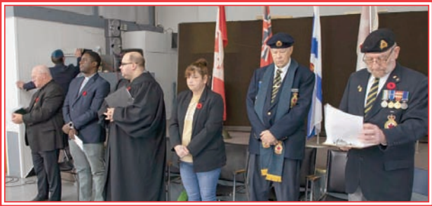
The names on the cenotaph were read, and the serving and past service members stood as a group.