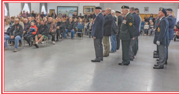
Our citizens responded to show their respect in numbers that surpassed all the seating available.