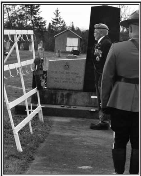
Dr Stephen Ellis, MP, could not be at all services, so he asked a Debert Legion member to lay wreath on behalf Government of Canada.