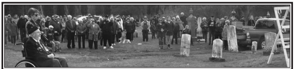
The many thousands of troops who passed through Debert during WW!! can be proud of the large crowds who attend Remembrance Day Services.