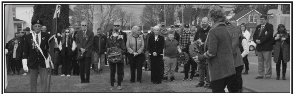
When the wreath cooperates, a large crowd always attends Debert Remembrance Day Services.