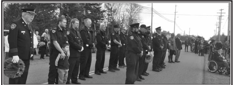
To ensure proper spacing between attendees, Plains Road was closed and used for those wishing to lay wreaths.