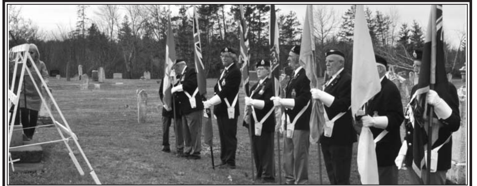
Debert Royal Canadian Legion colour party led the parade to the cenotaph and stood for laying of the wreaths on November 11th