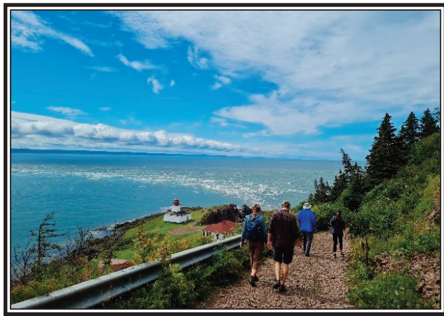
Nature lovers walking coastal trail near Cape D'OR, Cumberland County with terrific views of water, sky, beaches and former lighthouse. (Submitted)

Continued from page 1 of Fundy GeoPark Society. The funding will be announced on behalf of the Honourable Pablo Rodriguez, Minister of Canadian Heritage, and the Honourable Kamal Khera, Minister of Seniors.