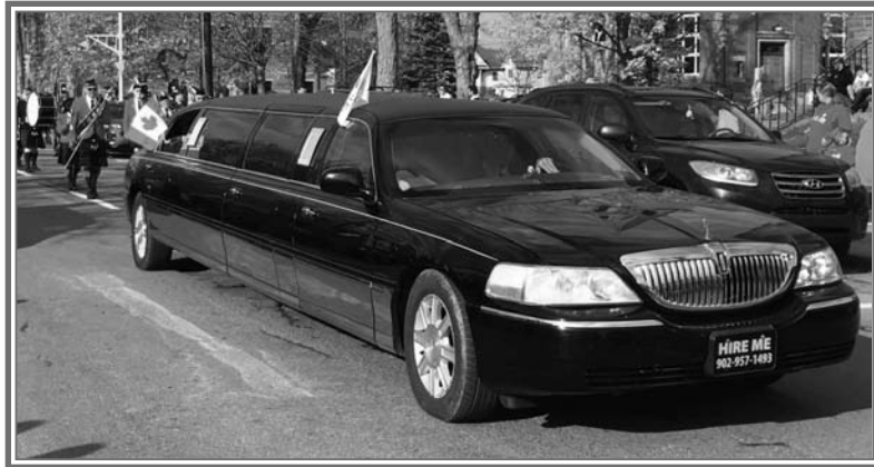
Six veterans from the Second World War marshalled the Remembrance Day parade in a stretch limousine on Prince Street in Truro on November 11th.