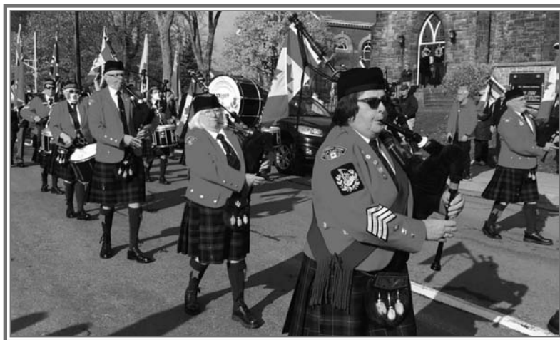
The sound of the Colchester Legion Pipes and Drums band filled the air as the band marched to Civic Square on Prince Street for Remembrance Day ceremonies on November 11th.