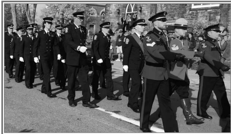
Representatives from the Royal Canadian Mounted Police, Truro Police Service, Truro Fire Brigade and Air, Sea and Army cadet programs were in full color and marched to the Cenotaph on Prince Street for Remembrance Day ceremonies.