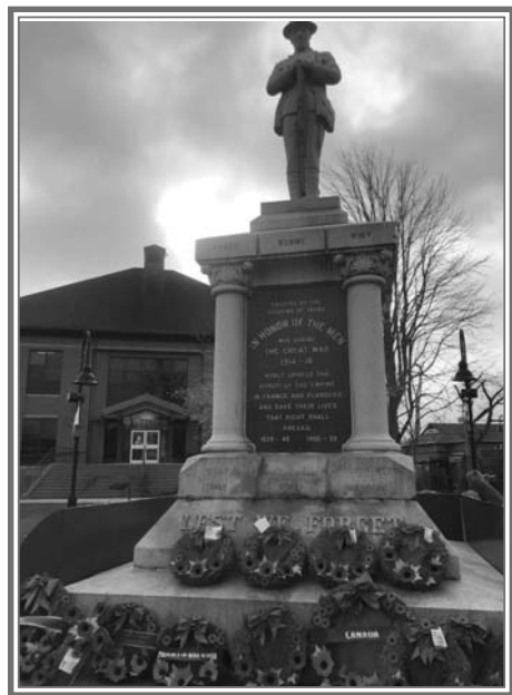
Wreaths laid in memory of soldiers who fought in past wars at the Cenotaph on Prince Street in Truro.