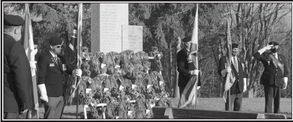
Colour Party at attention during the playing of the Last Post.

Due to the Pandemic a socially distanced Service of Remembrance was held at the Cenotaph in Londonderry at 2PM on Nov. 11th, 2020. (Harrington Photos)