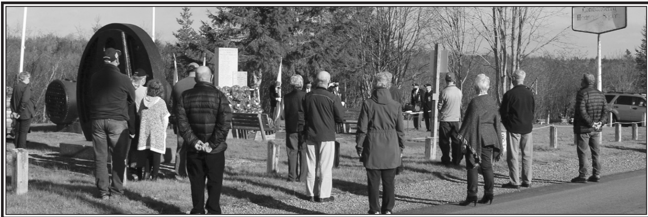
A small socially distanced crowd attended the service.