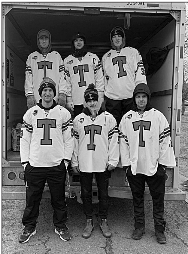
The Truro Jr. A Bearcats spent some time helping out recently at the annual food drive in Truro. The 'Cats are always happy to help with events supporting the community.