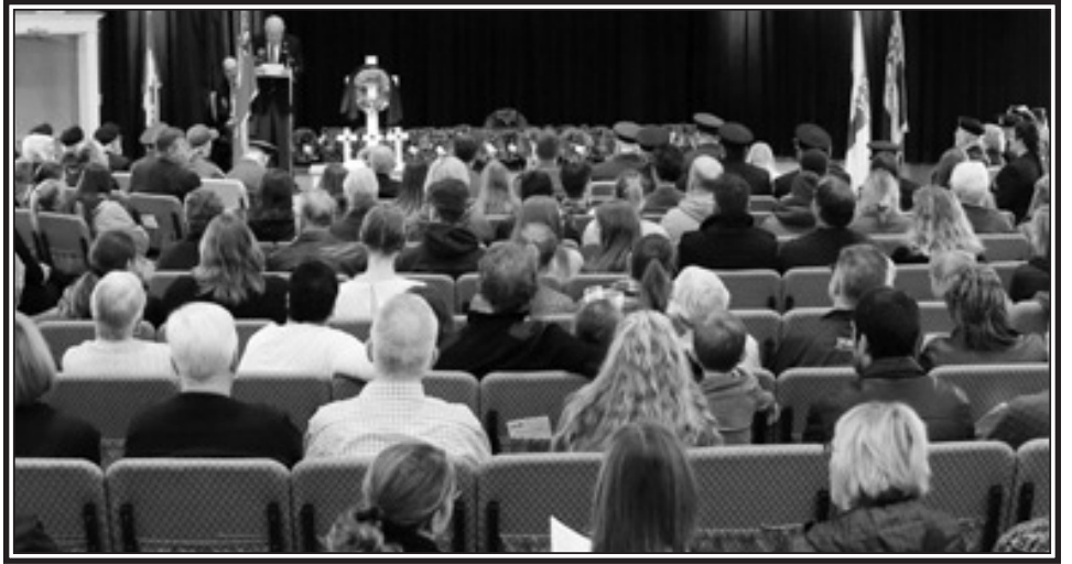
The sanctuary at Faith Baptist Church was filled to capacity and overflow seating was added in an adjoining room to accommodate all those in attendance.

Great Village Remembrance Day Service 2019 was held at Faith Baptist Church with over 400 in attendance, filling the main sanctuary and overflowing into an adjoining room.