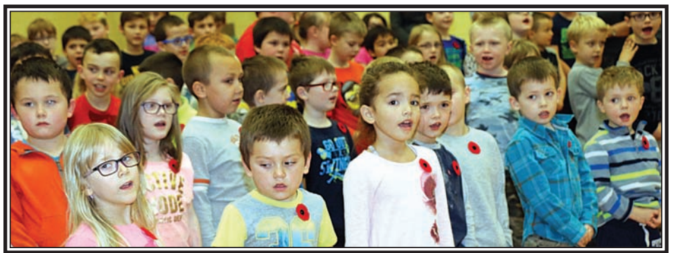
Debert Elementary students sang We Rise Again. They also sang this beautiful song at the combined morning service at the Veterans Memorial Park.

Debert Elementary Remembrance Day Service was held on Friday, Nov. 9th.